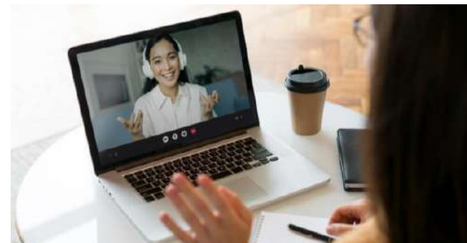
Online classes are led by the British Council teachers in public groups, closed groups or one-to-one