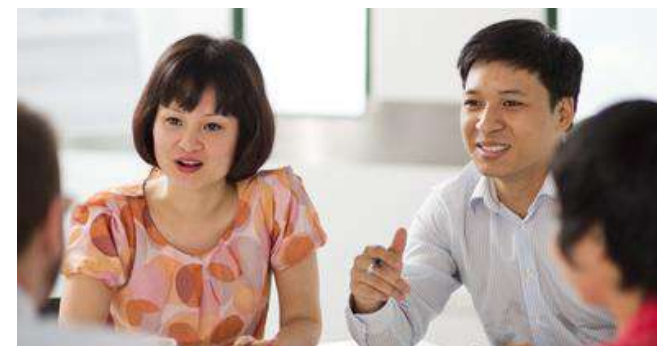
Professional Communication Skills courses are taught in immersive interactive workshops