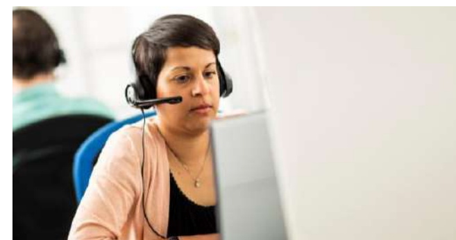
Use level tests to benchmark English levels, 'in-course' tests to track progress and 'high stakes' assessment for certification